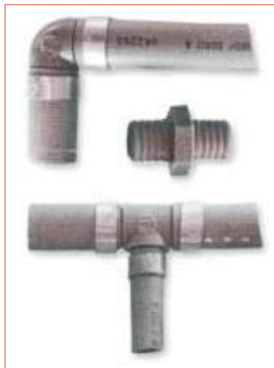
Plastic or acetal type fittings with aluminum crimp rings

With more than 25 years in the mechanical trades, I've seen a lot of new products come and go. In 1993 I was introduced to a flexible gray and blue water piping material known as polybutylene. Sold primarily under the brand name "Qest", it was cheap and