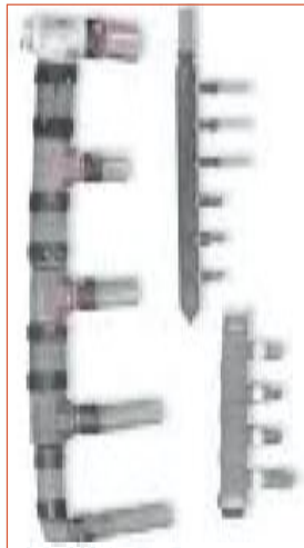
On site and factory made manifold units

“Home Run Plumbing”, involved pulling a series of 1/2" pipes from the hot and cold service locations behind each fixture to one location in or under the house.