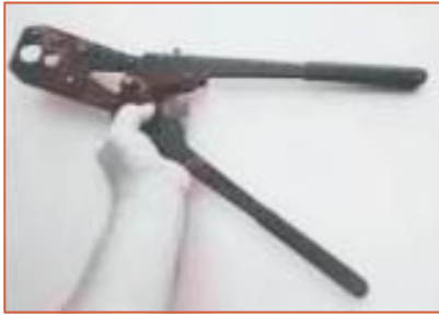
Combination crimp tool

were the standard for polybutylene connections. But over-crimped joints were showing up as split or snapped off fittings. Under crimped or missed crimps were also leaking and there were expansion rate concerns as well. Measures to stop the PB problems were put into place.