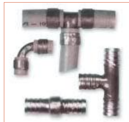
Copper fittings with copper crimp rings

Initially, aluminum crimp rings and plastic or "acetyl" fittings